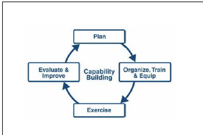
Figure 1: The preparedness cycle as outlined in the January 2008 National Response Framework. EPA has worked hard applying this approach to the aspects of many disasters for which it has primary responsibility.