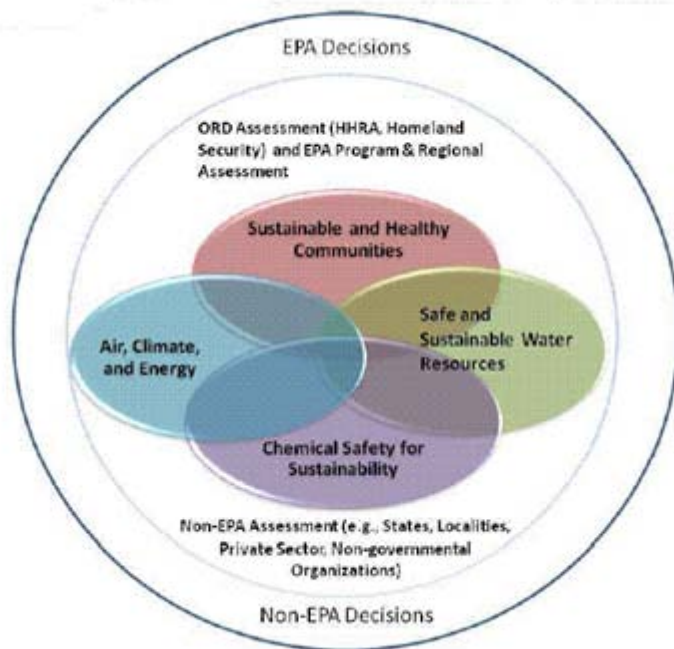
Figure 3 – ORD figure showing “Integrated EPA Research Programs Within EPA and Non-EPA Partner and Stakeholder Contexts;” figure used in the draft Chemical Safety for Sustainability Research Program framework