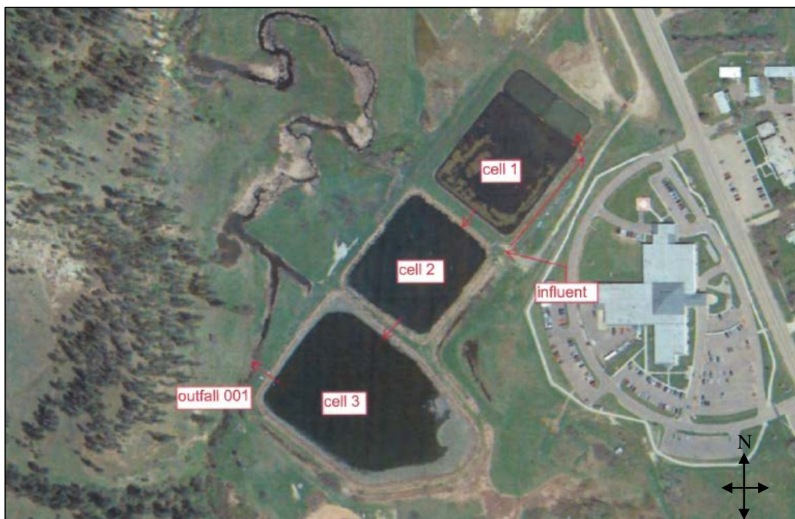
Figure 1. Lame Deer Lagoon WWTF

As depicted on the satellite image included with the permit application (Figure 1), influent enters Cell 1, moves through the cells consecutively, and is discharged to Lame Deer Creek from a point near the west corner of Cell 3.