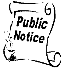
Table of Clean Water Act Civil Penalty Order Public Notices

(Posted below are penalties that have been publically noticed in last 30 days) Public Notice Archives