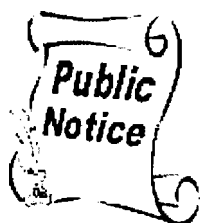
Table of Clean Water Act Civil Penalty Order Public Notices

(Posted below are penalties that have been publically noticed in last 30 days)