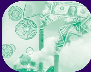
Pollution Charges, Fees, Taxes