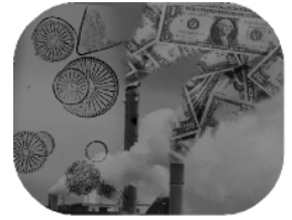
Pollution Charges, Fees, Taxes

Administrative costs are an important consideration when determining whether to create deposit systems. Ackerman et al. (1995) estimate that administrative costs average about 2.3¢ per container—more than $300 per ton for steel containers and $1,300 per ton for aluminum cans—in states with traditional legislation on beverage container deposit systems. A full accounting of the desirability of deposit-refund systems would compare administrative costs and the costs imposed on consumers with the benefits of reduced disposal costs, energy savings, reduced litter, and other environmental benefits. Deposit-refund systems appear best suited for products whose disposal is difficult to monitor and potentially harmful to the environment. When the used product has economic value, the private sector may initiate the program.