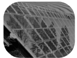
Subsidies for Pollution Control