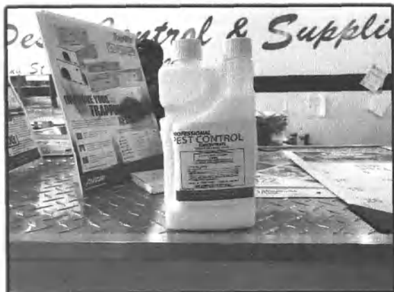
Figure 6: Professional Pest Control Concentrate Termiticide/Insecticide (EPA Reg No. 70506-7-72693)