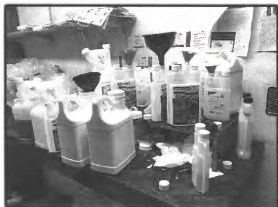
Figure 13: Production Site 2400 North Grand Boulevard, St Louis, Missouri 63106