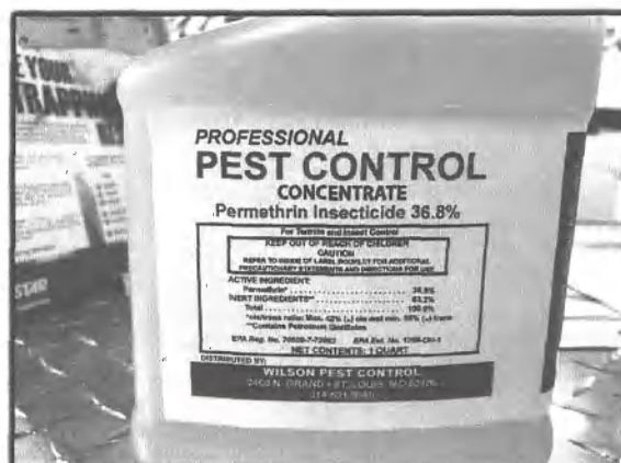
Figure 5: Professional Pest Control Concentrate, Permethrin Insecticide 36.8%