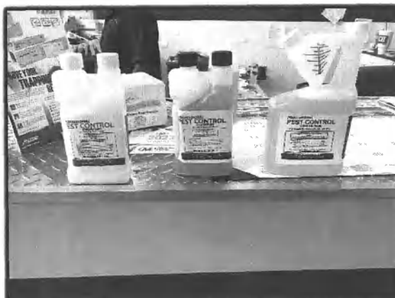
Figure 7: All three pest control products with same EPA registration numbering (EPA Reg No. 70506-7-72693) (EPA Est No. 1386-OH-1)