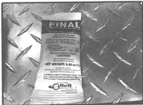
Figure 9: Final (EPA Reg No. 12455-91)