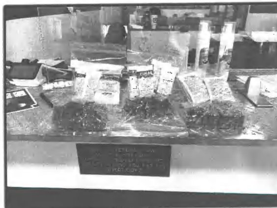
Figure 10: Rodenticide unlabeled blocks match with EPA registered rodenticides

Mr. Wilson showed us three different rodenticide products he currently offers for sale in what the industry refers to as “throw packs”: Final (EPA Reg No. 12455-91), Talon G (EPA Reg No. 100-1050), and Contrac (EPA Reg No. 12455-17). Products Final and Talon G are in 0.88 oz net weight throw pack bags and Contrac is in 1.5 oz net weight throw pack bags ( Figure 9 ). All three rodenticides had partial labeling that included registration numbers, first aid, and directions for use. Wilson’s repackages six of these throw pack bags into zipper top resealable, plastic bags with no added labeling. Mr. Wilson stated he does tell his customers to purchase an additional bait trap station. We asked Mr. Wilson if he also provides any other instructions or labeling with these products. Mr. Wilson said he sometimes provides the safety data sheet but recommends his customers Google the product for more information about the rodenticide.