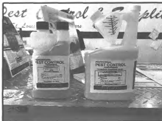
Figure 4: Professional Pest Control Concentrate, Permethrin Insecticide 36.8% 16 oz and 1Quart containers