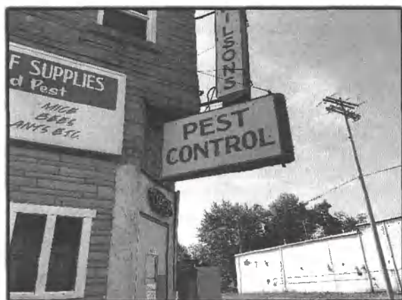
Figure 3: Wilson's Pest Control, Entry