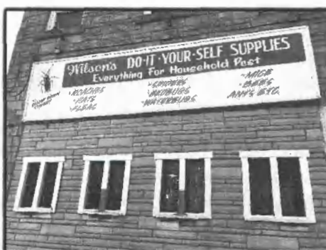
Figures 1 & 2: Wilson's Pest Control, 2400 North Grand Boulevard, St. Louis, Missouri 63106