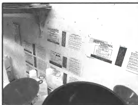
Figure 14: Production Site 2400 North Grand Boulevard, St Louis, Missouri 63106