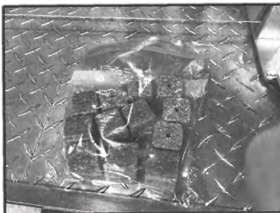
Figure 11: Maki Mini Blocks (EPA 7173-202)