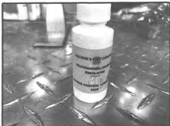
Figure 12: Wilson's Professional Growth Regulator (EPA Reg No. 53883-335)